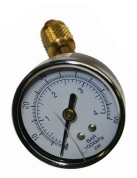
Combine with tubing/ adaptors to the right to make complete test kit.

AirSep<sup>®</sup> Test Pressure Gauge Item Number KI036-1